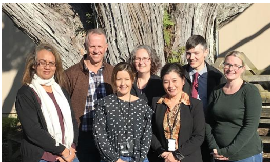
ESR's SHIVERS-II project team.

We would like to thank our SHIVERS-II participants for your good will, dedication, and insights. We are so grateful to have 2,186 Wellingtonians take part in this study. Because of this group of people, we are equipped to achieve our study's aim of better understanding people's immunity against the flu.