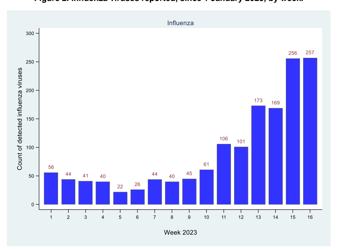
Figure 2. Influenza viruses reported, since 1 January 2023, by week.

This weekly report is compiled by ESR. For more information please contact: Tim Wood: T: +64 4 529 0611 E: Tim.Wood@esr.cri.nz Sue Huang: T: +64 4 529 0606 E: Sue.Huang@esr.cri.nz