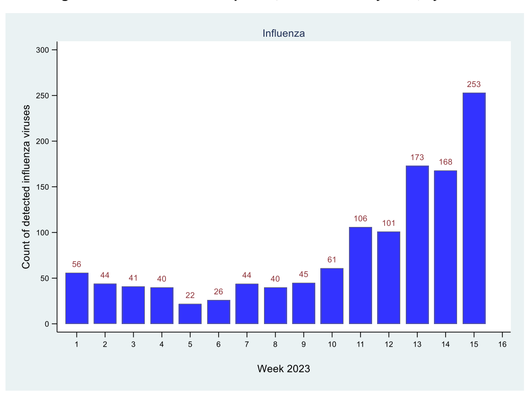
Figure 2. Influenza viruses reported, since 1 January 2023, by week.

This weekly report is compiled by ESR. For more information please contact: Tim Wood: T: +64 4 529 0611 E: Tim.Wood@esr.cri.nz Sue Huang: T: +64 4 529 0606 E: Sue.Huang@esr.cri.nz